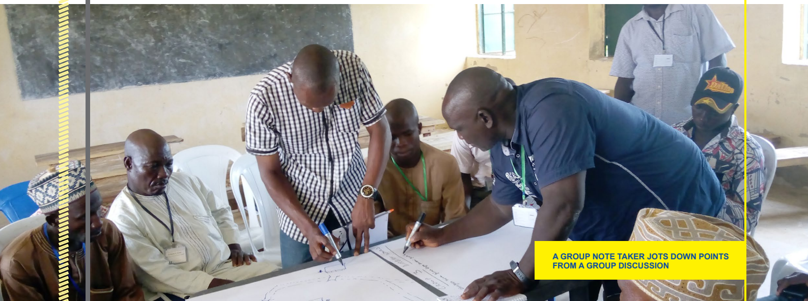
A GROUP NOTE TAKER JOTS DOWN POINTS FROM A GROUP DISCUSSION