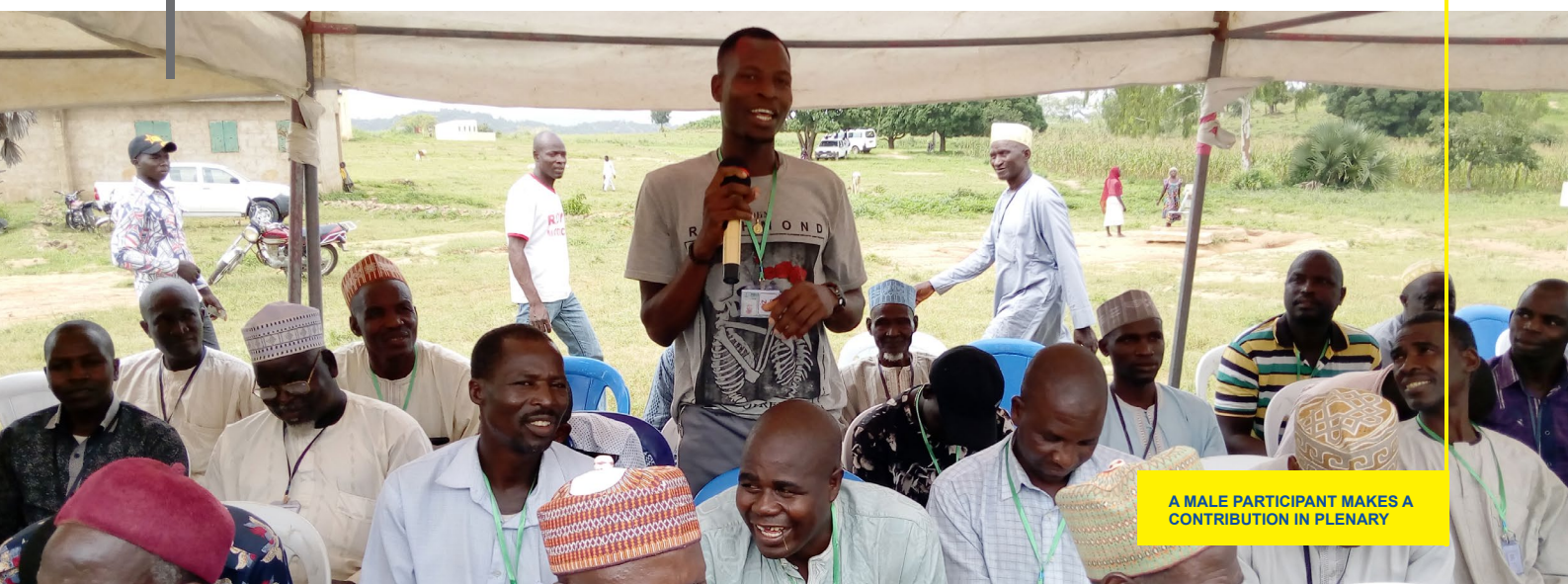
A MALE PARTICIPANT MAKES A CONTRIBUTION IN PLENARY