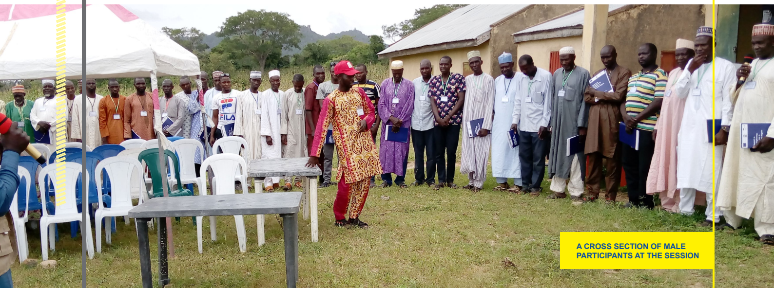
A CROSS SECTION OF MALE PARTICIPANTS AT THE SESSION