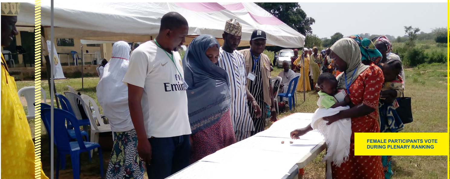
FEMALE PARTICIPANTS VOTE DURING PLENARY RANKING