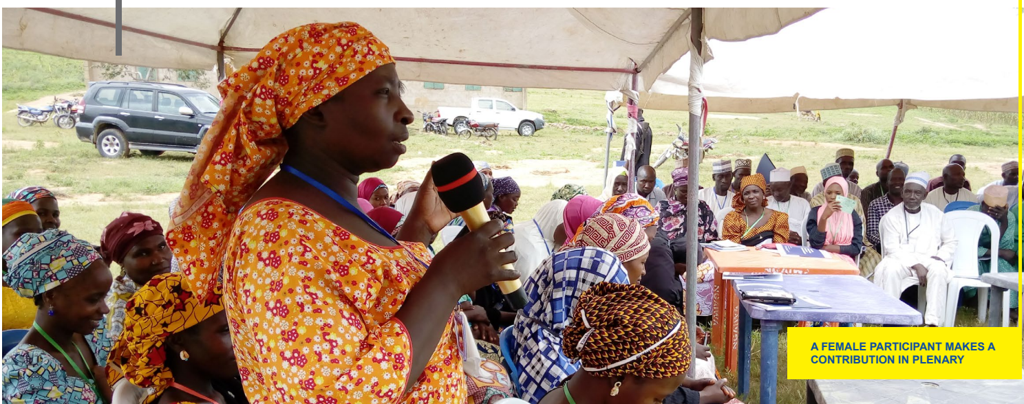
A FEMALE PARTICIPANT MAKES A CONTRIBUTION IN PLENARY