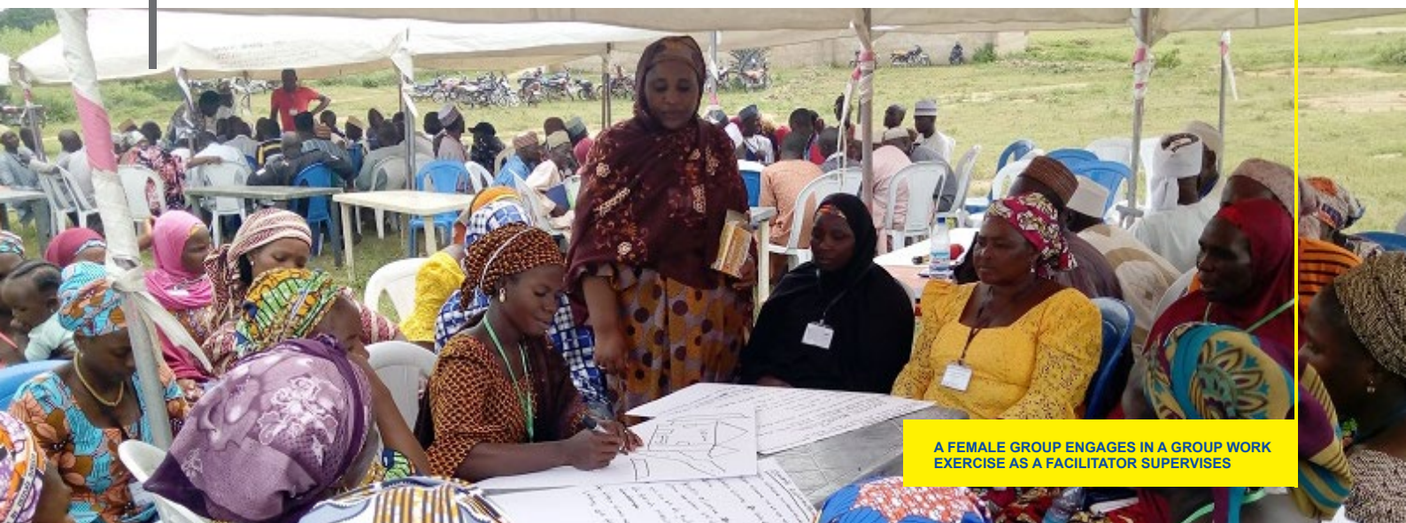
A FEMALE GROUP ENGAGES IN A GROUP WORK EXERCISE AS A FACILITATOR SUPERVISES