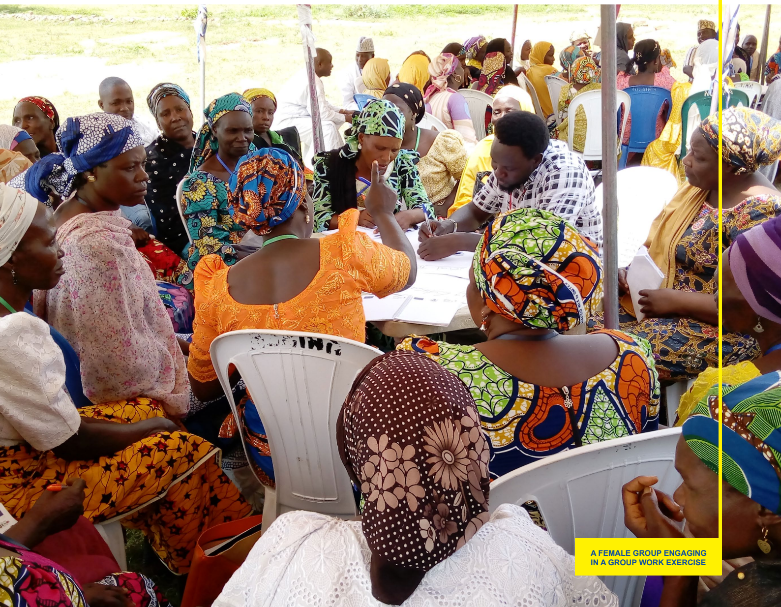
A FEMALE GROUP ENGAGING IN A GROUP WORK EXERCISE