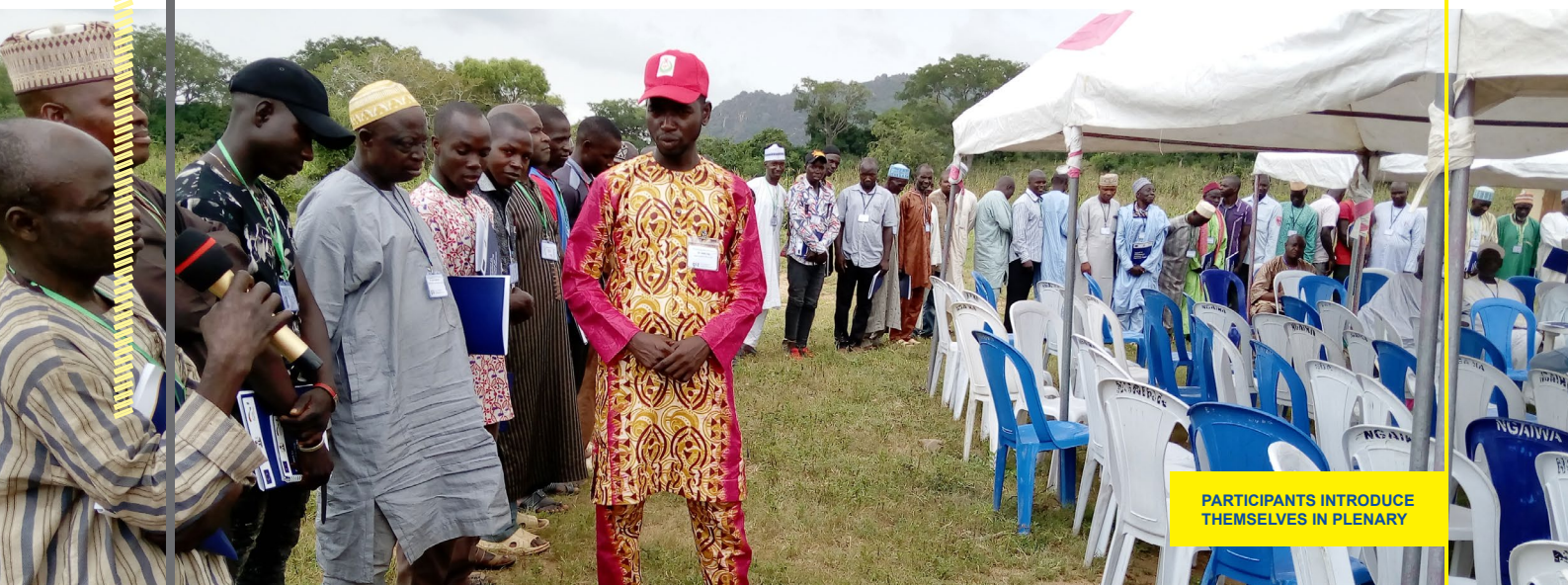
PARTICIPANTS INTRODUCE THEMSELVES IN PLENARY