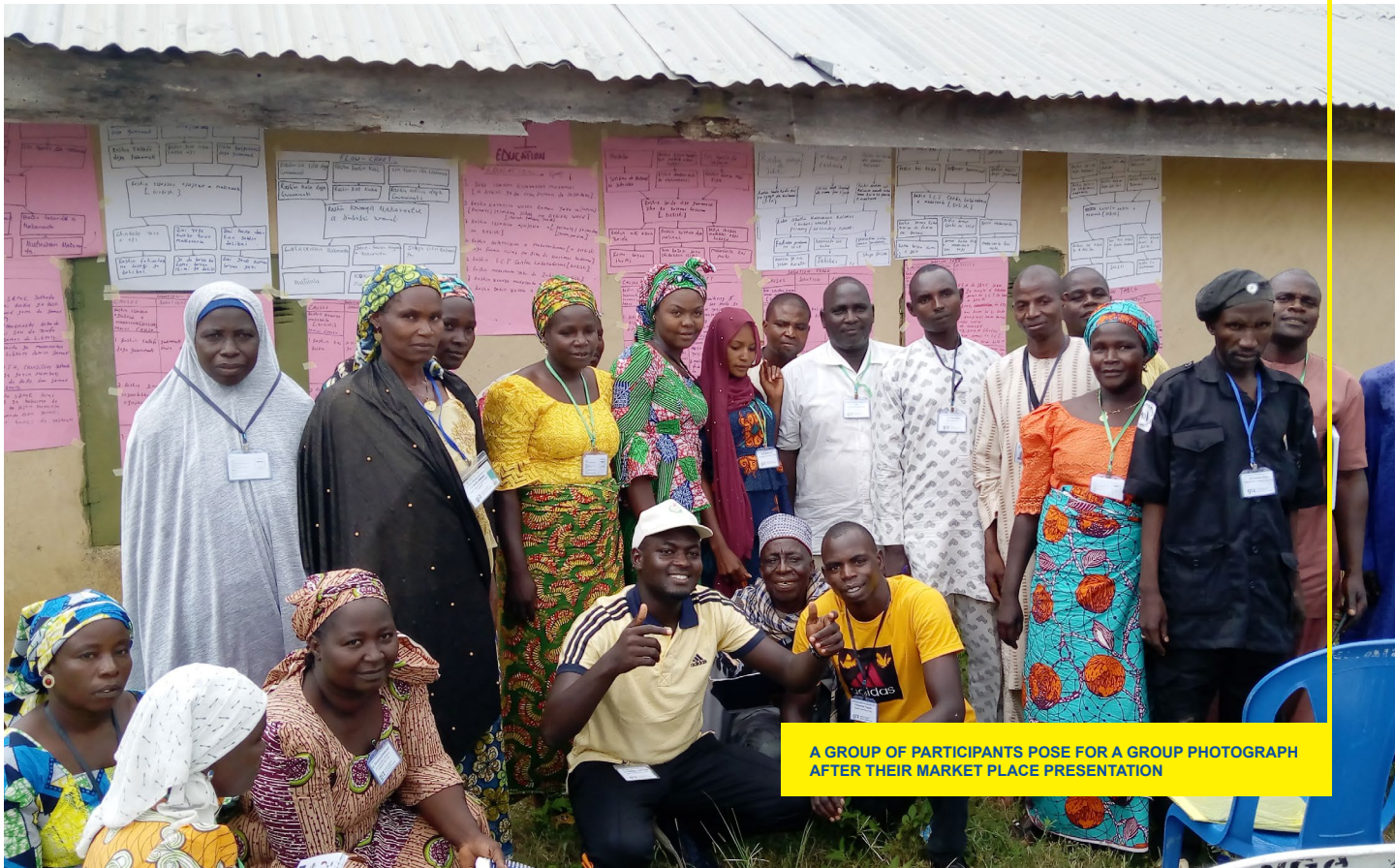
A GROUP OF PARTICIPANTS POSE FOR A GROUP PHOTOGRAPH AFTER THEIR MARKET PLACE PRESENTATION

Development to us is the advancement and progress of a community signified by job opportunities, standard and qualitative healthcare and other basic social amenities. Furthermore, these sessions have enabled us to identify our shared values, which are hard work, self-reliance, sympathy for one another, respect for humanity and support for one another. Inadequate pipe-borne water, lack of a good drainage system, non-availability of refuse dump sites, high rate of theft, kidnapping, inadequate qualified teachers in public schools, dilapidated classrooms, drug abuse, denial of the girl child access to education and poor road networks are some of the challenges that hinder the development of our ward. At the end of the sessions, a 26-man follow-up committee was established and tasked with the responsibility of advocating and lobbying for projects on behalf of our communities.